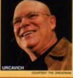
URCAVICH COURTESY, THE ORGANIZATION