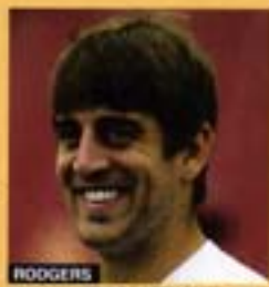
RODGERS