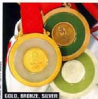
GOLD, BRONZE, SILVER

Ever wonder what athletes end up doing with their medals when they return home? We asked some of our Olympians for all of the details, including their favorite post-Olympic appearances. More importantly, these men and women honor Christ as they compete on the world's highest athletic stage.